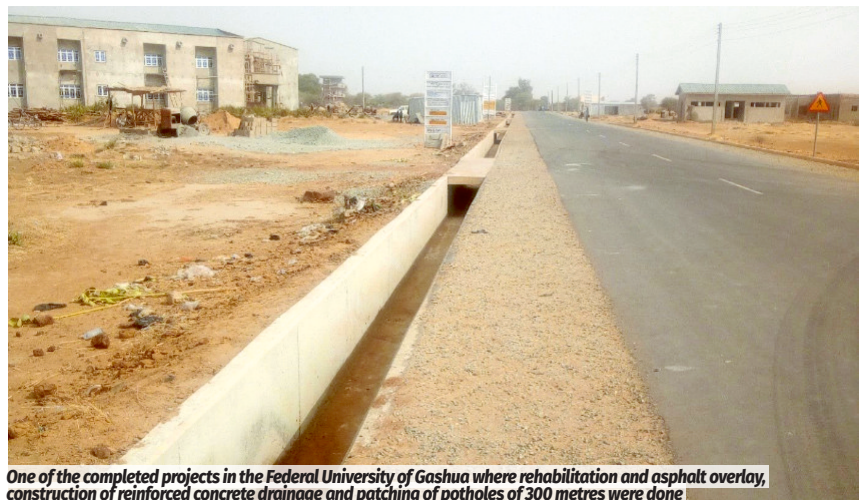
One of the completed projects in the Federal University of Gashua where rehabilitation and asphalt overlay, construction of reinforced concrete drainage and patching of potholes of 300 metres were done