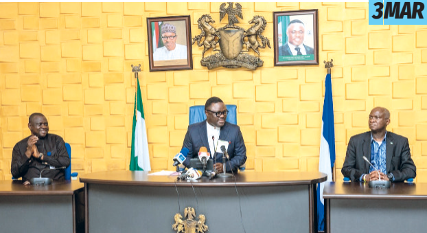
Cross River State Governor Ben Ayade playing host to Works and Housing Minister Mr. Babatunde Raji Fashola, SAN, who paid him a courtesy visit in his office in Calabar during the Verification Tour of the Inter-Ministerial Committee on The Reimbursement of Expenditure incurred on Federal Government projects by State Governments.