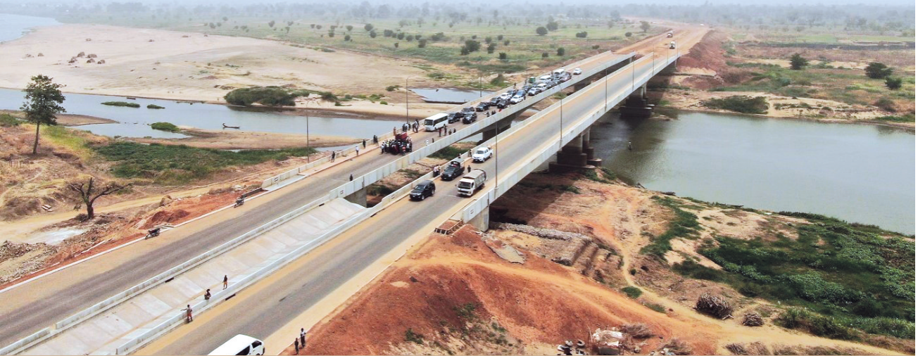
Aerial view of the 2.2km Loko-Oweto Bridge over River Benue, linking Loko in Benue State and Oweto in Nasarawa State...during an inspection by the Minister of Works & Housing Babatunde Raji Fashola, SAN and the Minister of State, Engr Abubakar D Aliyu, FNSE and a group of journalists