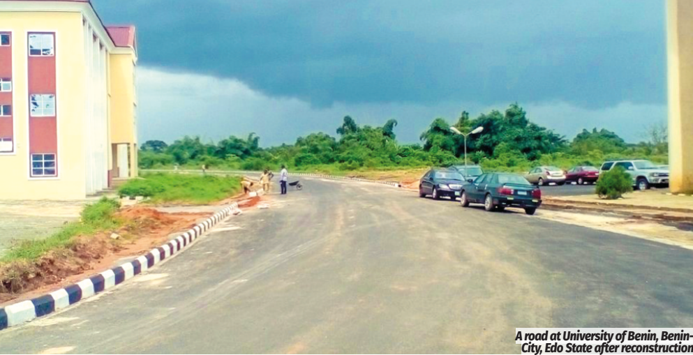
A road at University of Benin, Benin City, Edo State after reconstruction