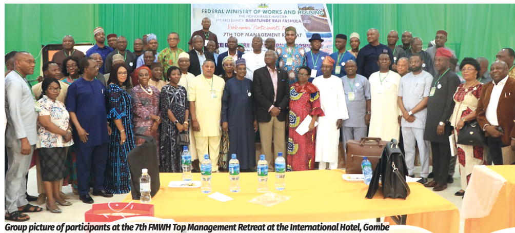
Group picture of participants at the 7th FMWH Top Management Retreat at the International Hotel, Gombe