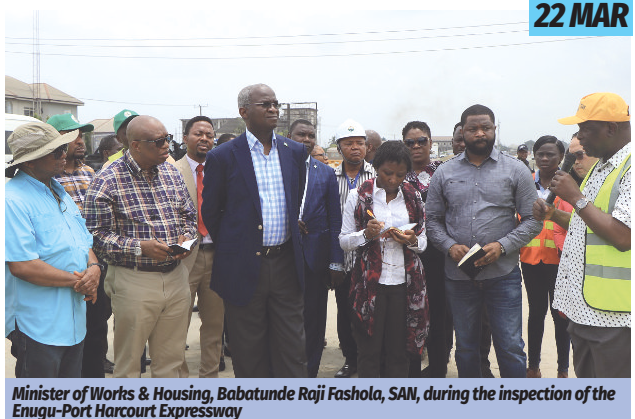
Minister of Works & Housing, Babatunde Raji Fashola, SAN, during the inspection of the Enugu-Port Harcourt Expressway