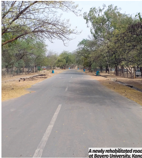
A newly rehabilitated road at Bayero University, Kano