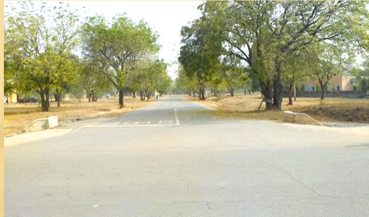
A newly rehabilitated road at Bayero University, Kano, Kano State

O NE University vice-chancellor was effusive. Indeed, when he found his words, he said: "I am excited, excitement is the summary here, in fact any other adjective I use now will water down my joy."