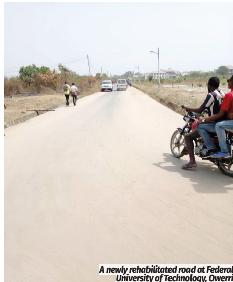
A newly rehabilitated road at Federal University of Technology, Owerri