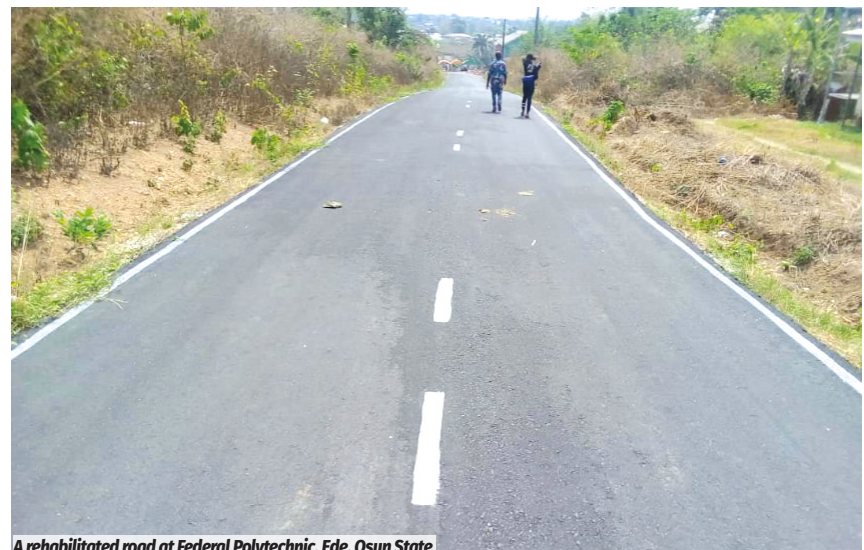
A rehabilitated road at Federal Polytechnic, Ede, Osun State