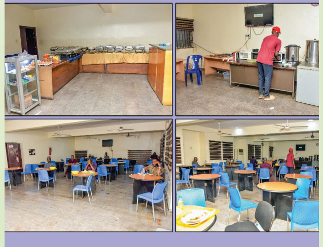
FMW Staff Canteen