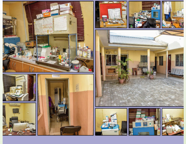
FMW Staff Clinic