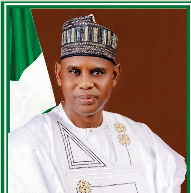
Hon. Bello Muhammad Goronyo, Esq Honourable Minister of State Works Federal Republic Of Nigeria