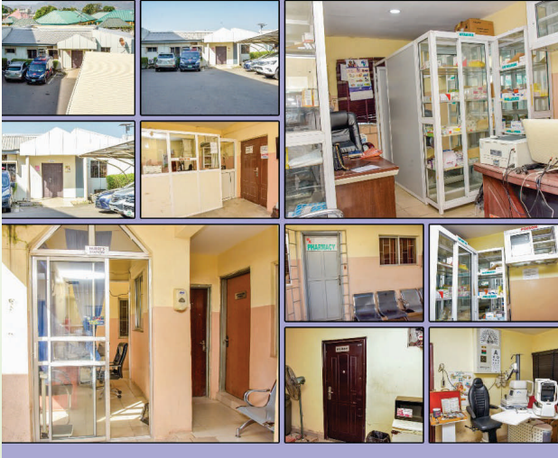
FMW Staff Eye Clinic