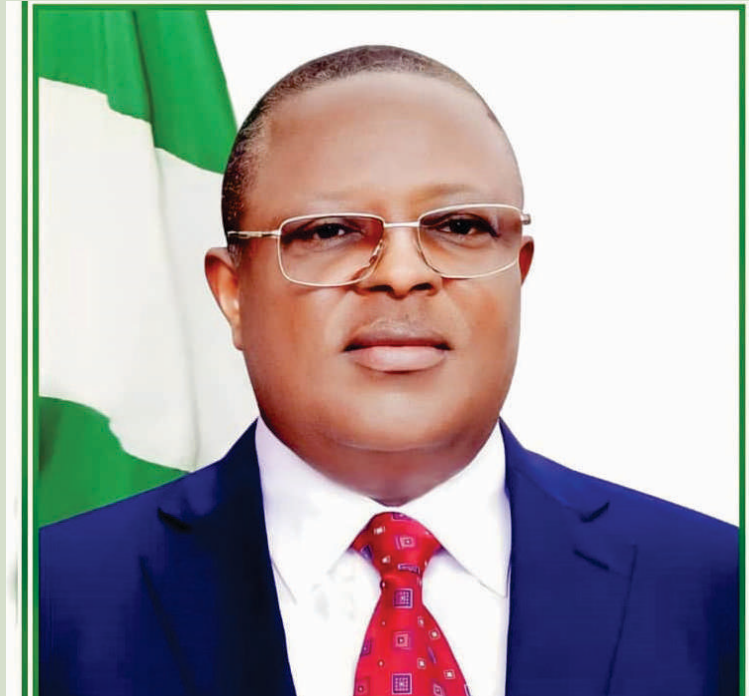
H.E. Sen. (Engr.) David Umahi, CON, FNSE, FNATE Honourable Minister of Works Federal Republic Of Nigeria.

The Ministry has two Ministers, the Honourable Minister, H.E Sen. (Engr.) David Umahi, CON, FNSE, FNATE and the Honourable Minister of State, Bello Muhammad Goronyo, Esq., while the Permanent Secretary is Engr. Olufunso Adebisi, FNSE.