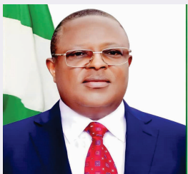
H.E. SEN (ENGR) David Nweze Umahi, CON, FNSSE, FNATE Honourable Minister of Works Federal Republic Of Nigeria.

Dear Esteemed Readers, I bring to you, the maiden edition of 'Road Infrastructure e-Newsletter'. This is an innovative monthly online publication of the Federal Ministry of Works. As the premier volume, this will serve as a prelude into showcasing the Ministry's core mandate, which is the provision of critical road infrastructure to Nigerians. In the subsequent editions, readers will be having a peep into efforts being made by the Renewed Hope Administration of His Excellency, President Bola Ahmed Tinubu, GCFR in changing the face of Nigeria's road network.