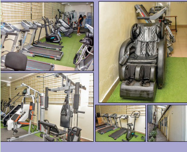
FMW Gym Center